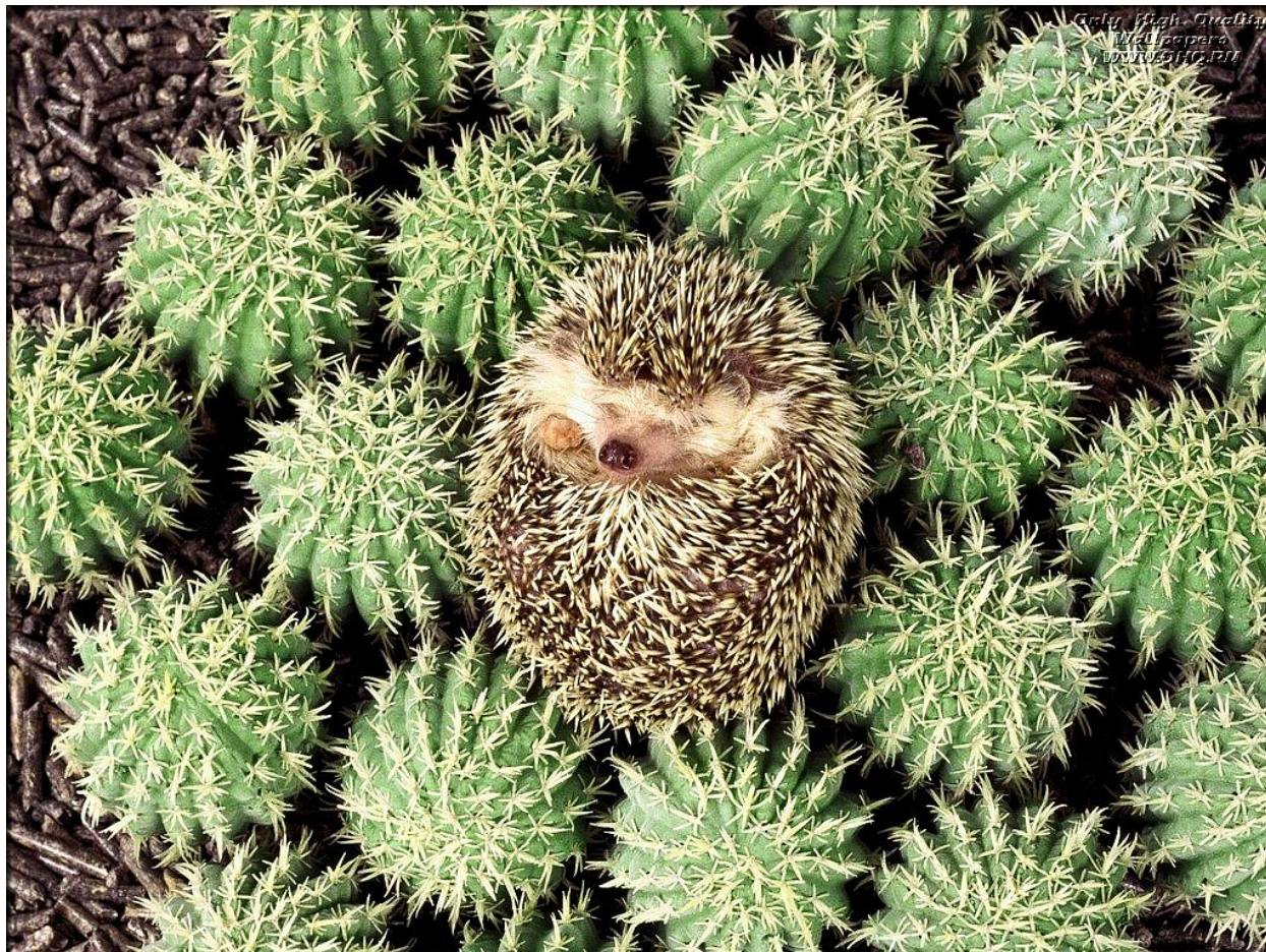
FIGURE 2. By Corollary 6.17, it's impossible to smoothly comb this hedgehog. It doesn't seem to mind, however.

Another consequence (and the reason for the name of the theorem) is that if one tries to comb the spikes on a hedgehog, 5 there will be some point where they can't be combed flat; see Figure 2.